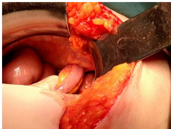
Fig. 2 – Drain site incarceration of an ileal loop.

carceration of an ileal loop (Figure 2). The wall of herniated intestinal loop was damaged because of multi-day incarceration (Figure 3). During the surgery, a residual peritoneal opening at drain site was visible (Figure 4). A 5 cm long small-bowel segment was resected and end-to-end anastomosis performed. The abdominal wall defect was sutured. The patient's further recovery was excellent, and the patient was discharged 13 days after the second surgery. At present, 13 months after the operation, the patient did not experience any recurrence of hernia.