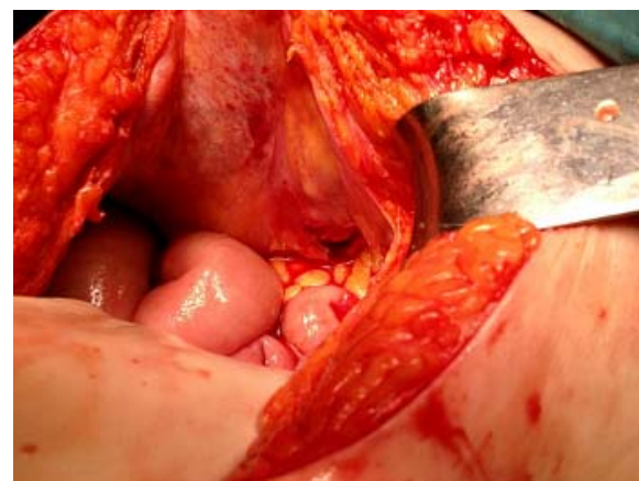
Fig. 4 – Residual peritoneal opening at abdominal drain site.