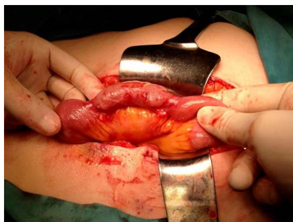
Fig. 3 – Herniated ileal loop with altered wall morphology as a consequence of multi-day incarceration.